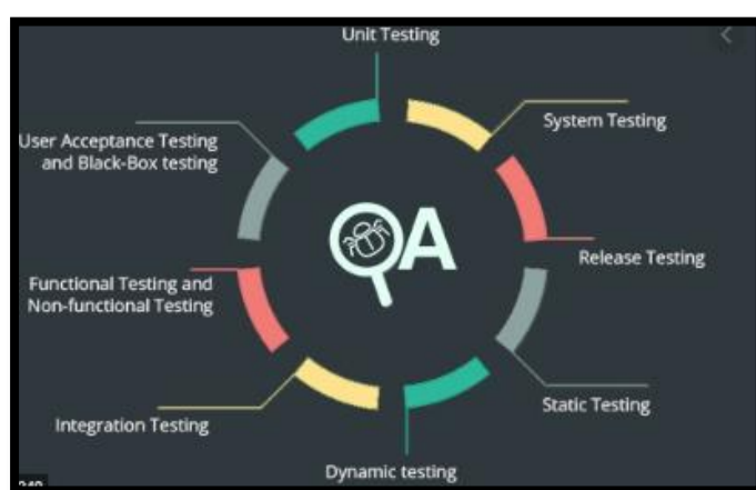
Figure 1. Quality assurance (Source: [11])

extraordinary prerequisites can be satisfied." The self-guarantee furnished with the asset of the utilization of value confirmation is twofold—inside to control and remotely to clients, government organizations, controllers, certifiers, and outsiders. An extrude definition is "every one of the arranged and orderly exercises completed in the extraordinary framework that can be analysed to offer confidence that help the product to fulfil prerequisites for quality. As per the word of [11], quality assurance supports an organization to meet the proper ISO level of a manufactured product. As a result it supports the organization to gain customer loyalty and enhance the brand value of the organization.